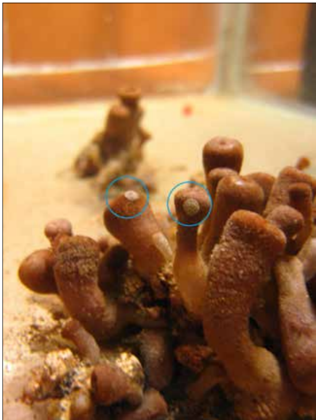
Fig. 3. Aeolidiopsis eggs on the anterior polyp stem

species (Todd et al. , 2001). Their diet includes anemones, corals, octocorals, zoanths (McDonald and Nybakken, 1991; Carmona et al. , 2013). The nudibranchs also have added benefit as they are acquiring energy from the organic matter produced by the zooxanthellae which shares a symbiotic relationship with the main prey species (McFarland and Muller-Parker, 1993). Therefore, it can be suggested that the Aeolidiopsis sp. might be a facultative ectoparasite on P. mutuki .